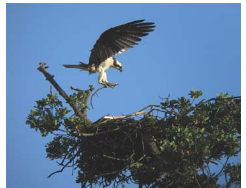
Ospreys at Rutland Water

The space will be used to present a series of displays on a range of themes including sustainable transport, natural, built and cultural heritage, trade, welcomes, the local economy and local produce. Each poster will address why these issues are important and what we can do to help make our communities more sustainable. For example, we can support our natural heritage by planting native species, putting up bird boxes or digging a pond. This is sustainable in terms of our local economy as it retains and enhances local distinctiveness and so increases the aesthetic appeal of the area to visitors.